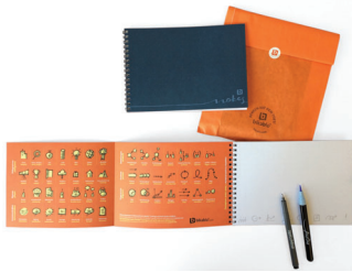
Thought Sketching Kit

Every participant will receive a starter kit which includes;